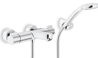
AB87010CR External thermostatic mixer tap with duplex