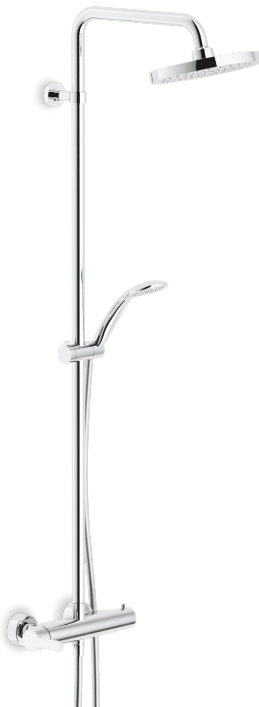
AB87130/30CR External single control mixer, swivel shower head ø 200 mm with rain jet, single jet shower head