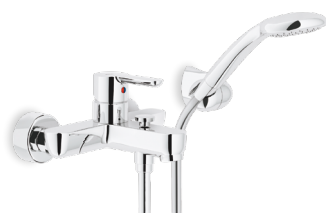
AB87110CR External single control mixer tap with duplex