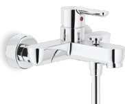
AB87110/1CR External single control mixer tap