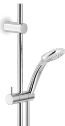
AD140/39CR 650 mm wall rail with single jet shower head