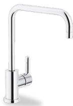
AB87134CR Single control mixer tap with swivelling spout