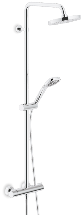
AB87030/30CR External thermostatic mixer, swivel shower head ø 200 mm with rain jet, single jet shower head