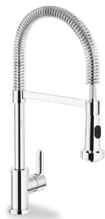
AB87300/3CR Single control mixer tap with swivelling spout and two-jet directional shower head