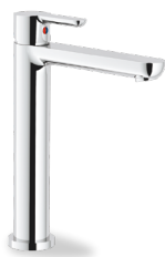
AB87713CR Single control mixer tap with swivelling body