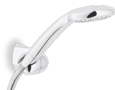
AD144/4CR Directional support with single jet shower head